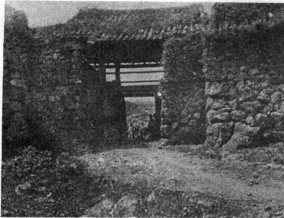
Figure 2. West gate of Cheju castle, 1910. The West Gate portico in the wall of Cheju Castle was photographed by Anderson (1914: 215).