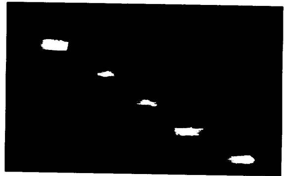
Figure 1. Light emitted from scintillating films along with the moving radiation source Ir-192, 10.5 Ci) in the opaque guide tube

The relative brightness of the film with various inorganic scintillating materials was measured and listed in Table 1. As listed in Table 1, a scintillating film with Gd_2O_2S:Tb